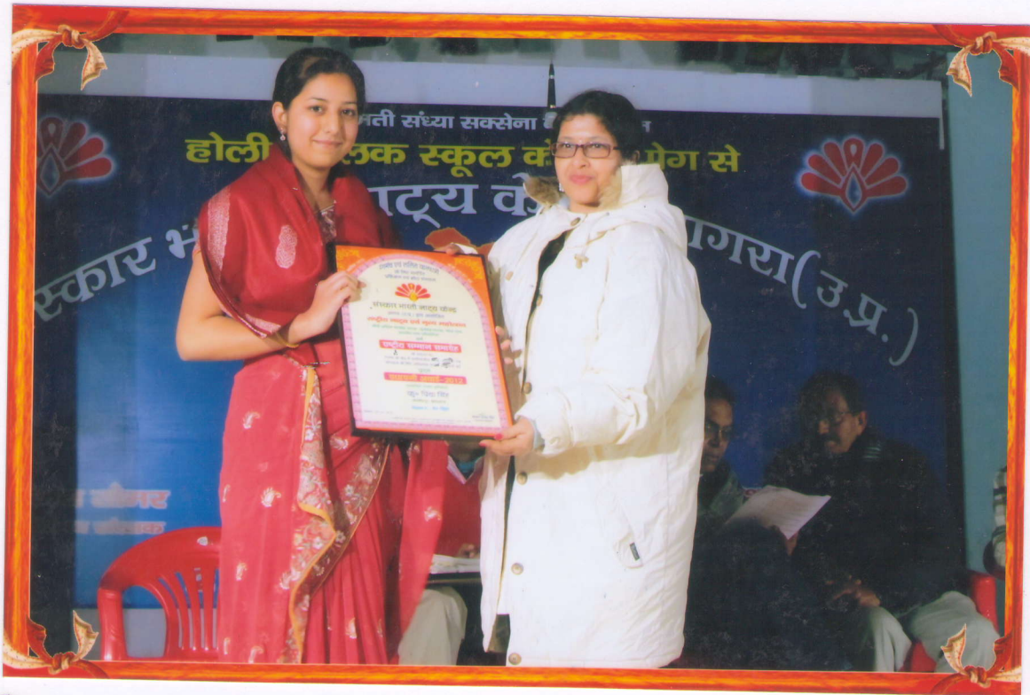
PRIZE WINNERS OF ALL INDIA DRAMA COMPETITION