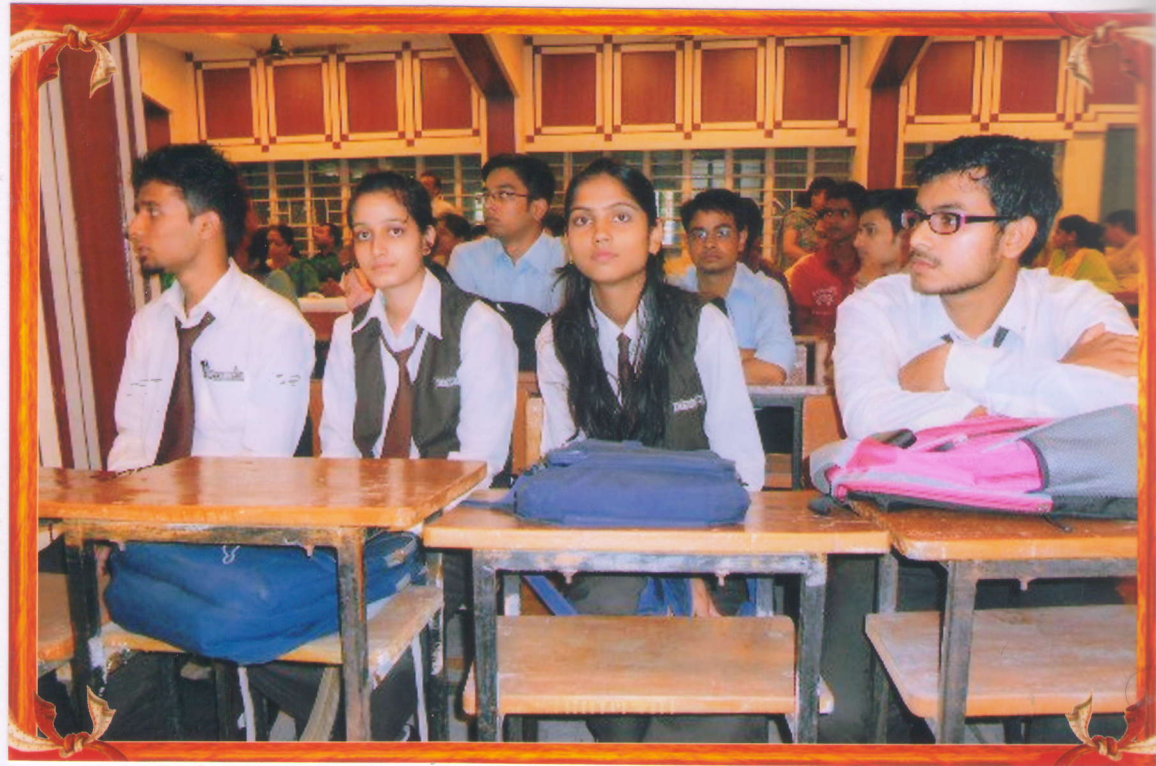
STUDENT'S MEET IN - SARVAMILAN