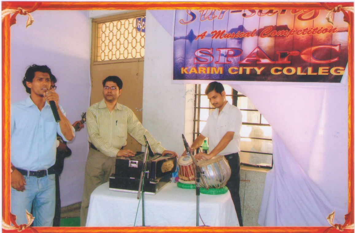
A Musical Competition ...