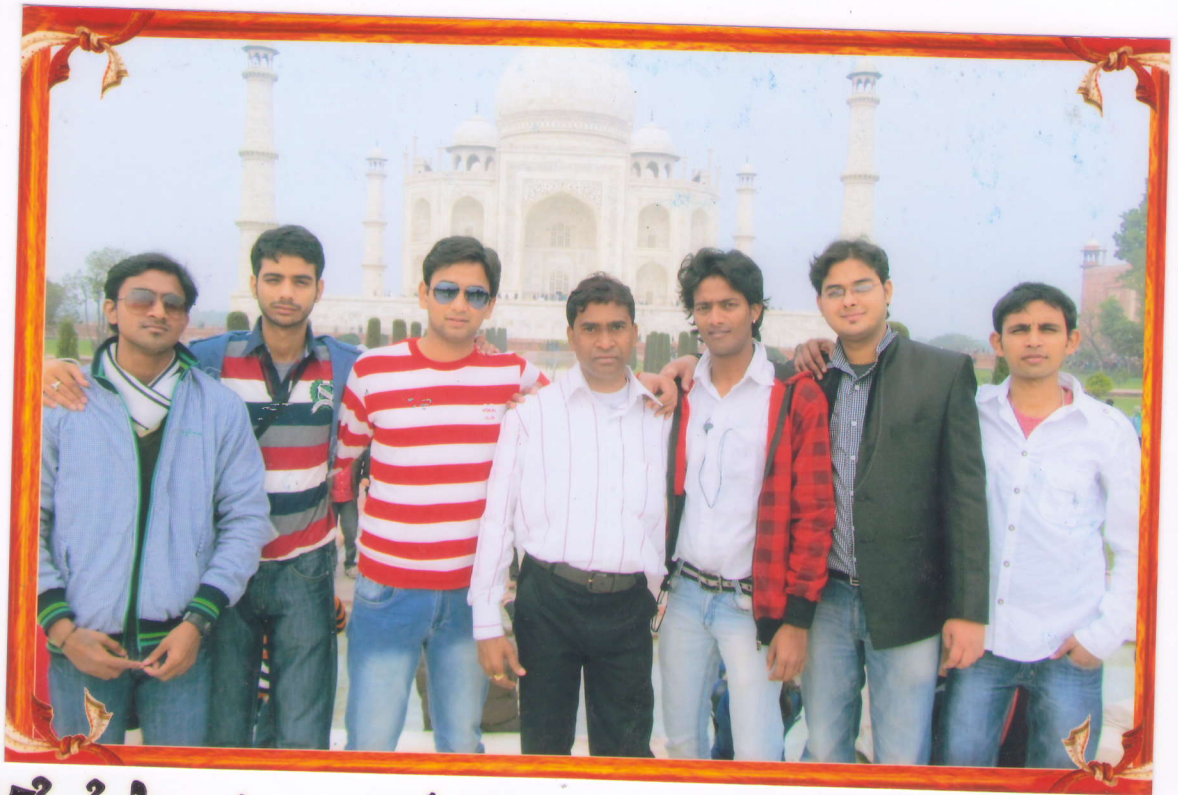
Visit to Taj Mahal 28