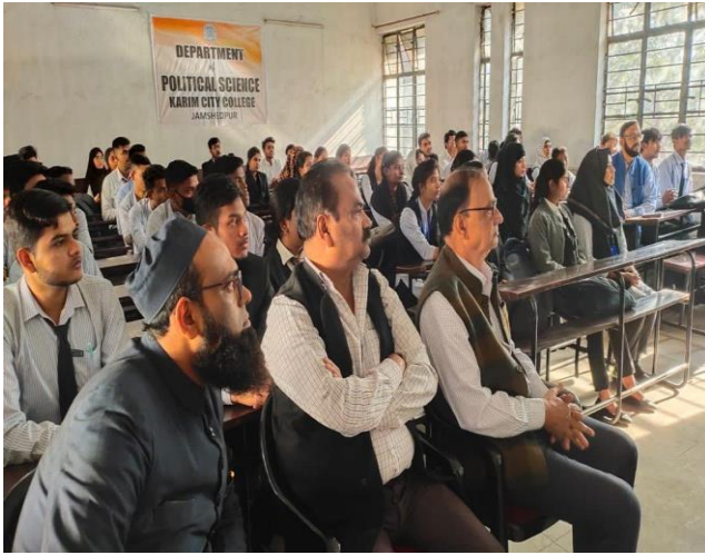
Faculty and students attended the seminar