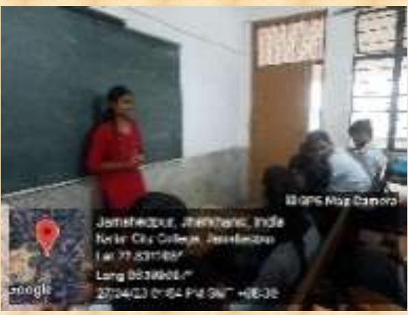
Alumni Speak 26 April 2023