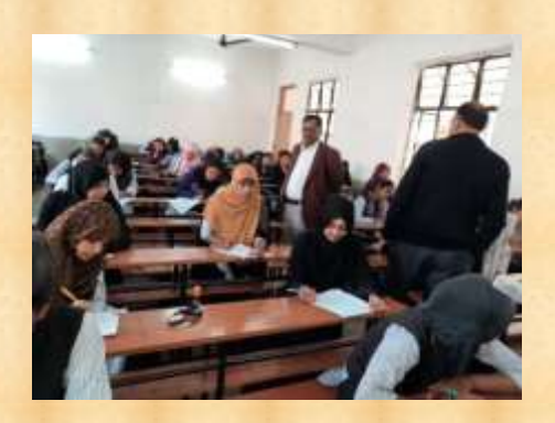
Internal Exam 28<sup>th</sup> and 29<sup>th</sup> November 2022