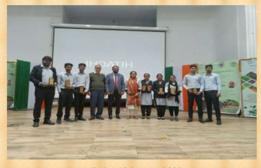
Adivtiya 10 January 2023