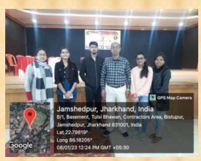
Visit to Coin Exhibition 8<sup>th</sup> Jan 2023