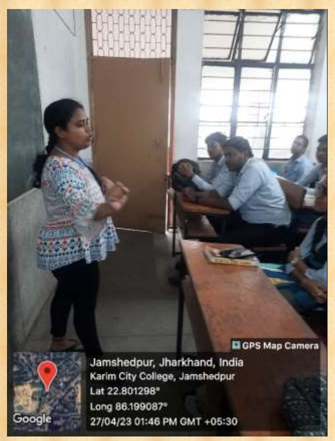
Alumni Speak 26 April 2023