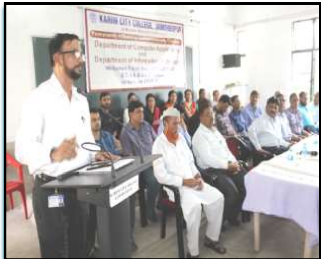
_ Prof-in-charge welcoming the students