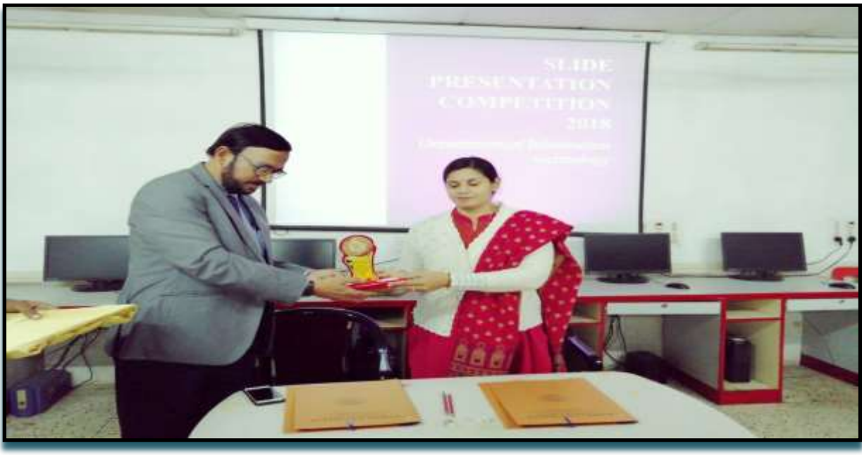
Token Of Love Presented To The Judge