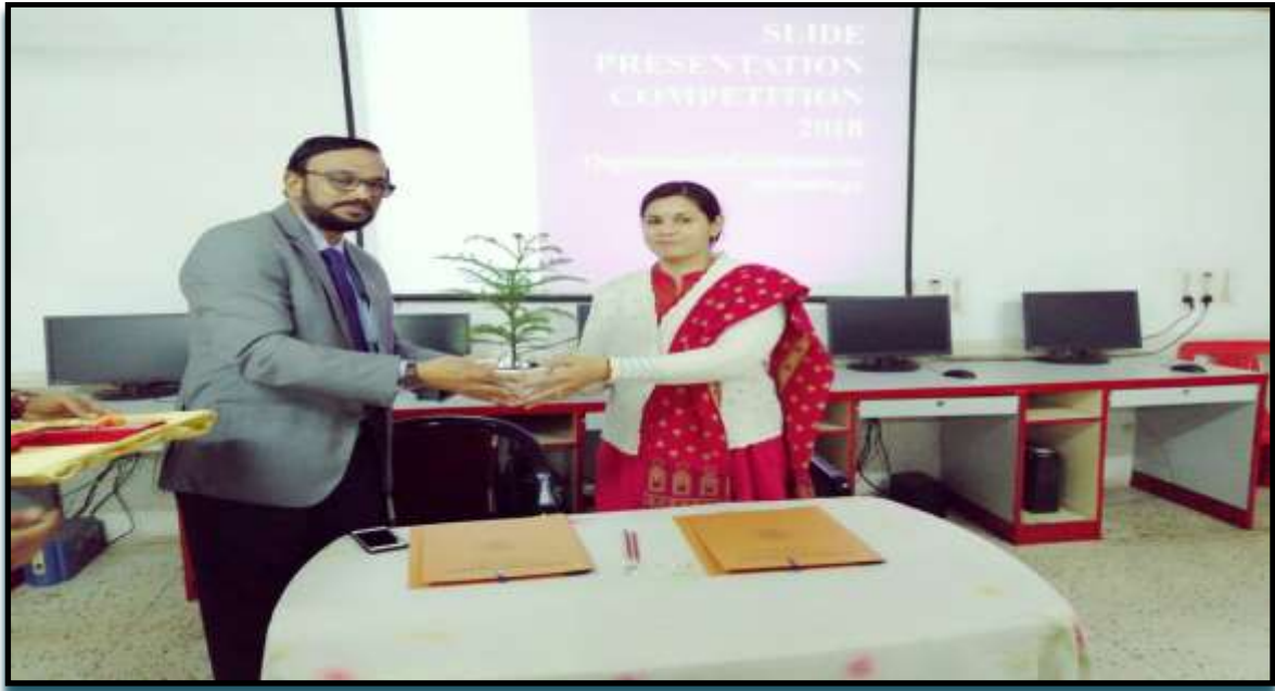
Prof-in-Charge of Department IT Welcoming The Judge