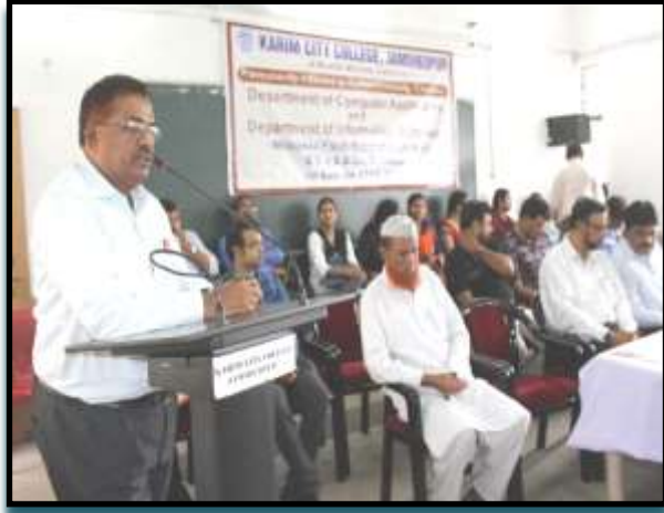
Incharge Admissions Addressing The Students