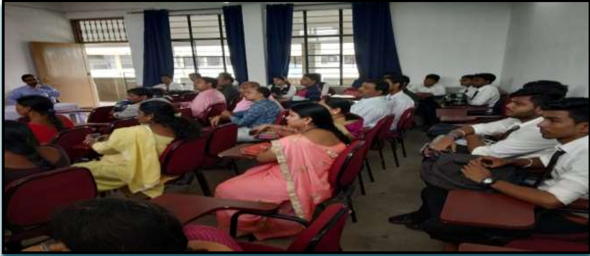
Parents & Students of IT-Part1