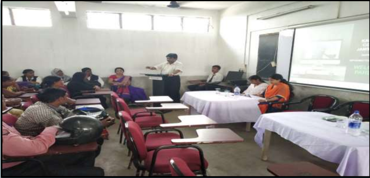
Principal Addressing The Parents & Students