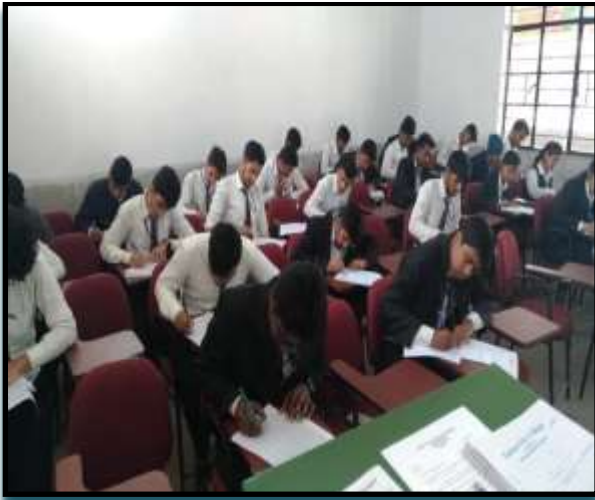
Sem I Internal Exam