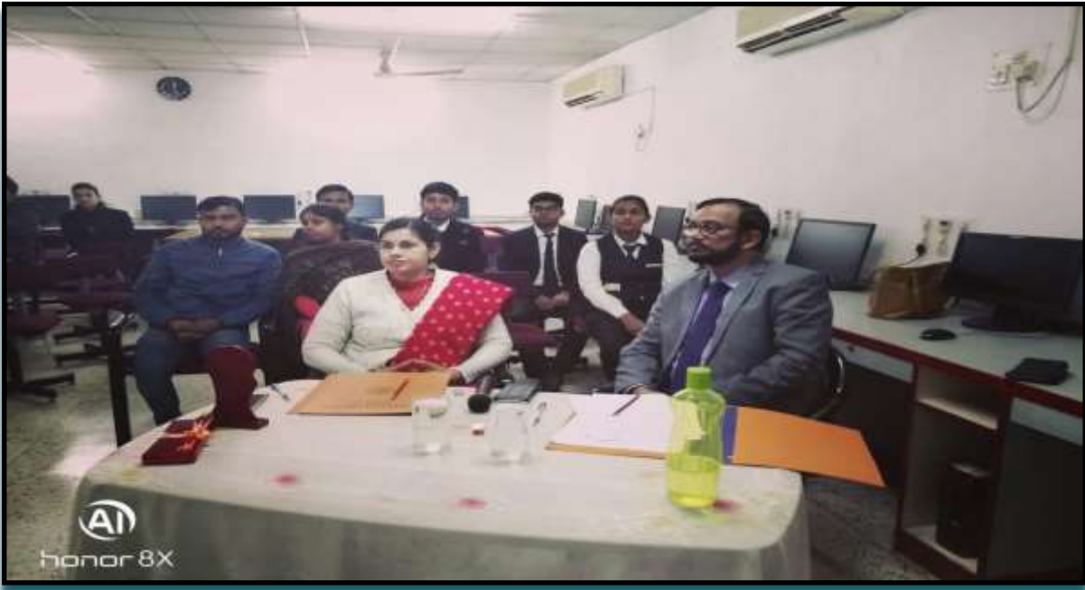
Judges Observing The Presentations