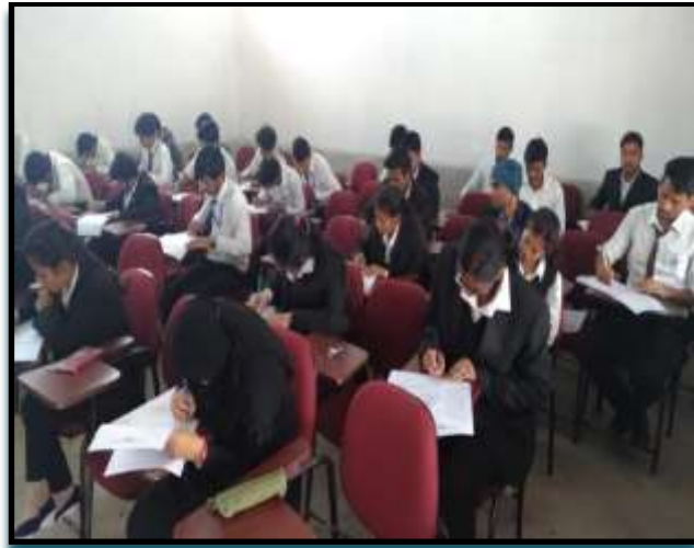
Sem III Internal Exam