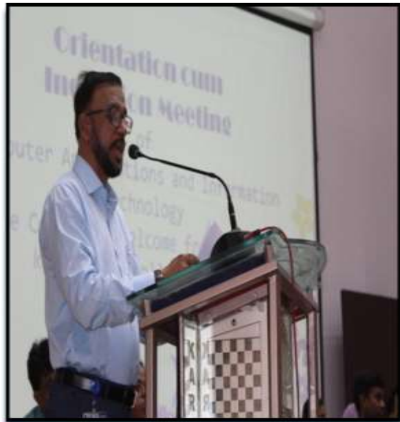
Principal Addressing The Students Prof-In-Charge Giving Welcome Speech