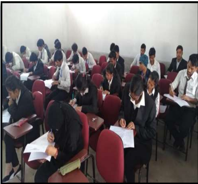
Sem I & Sem V Internal Exam