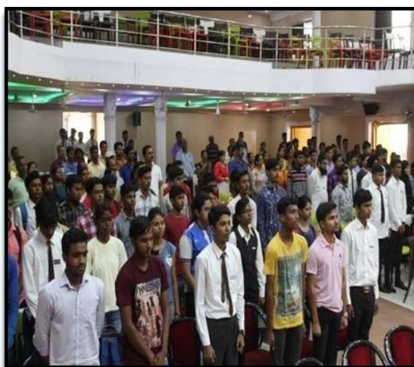
Parent & Students