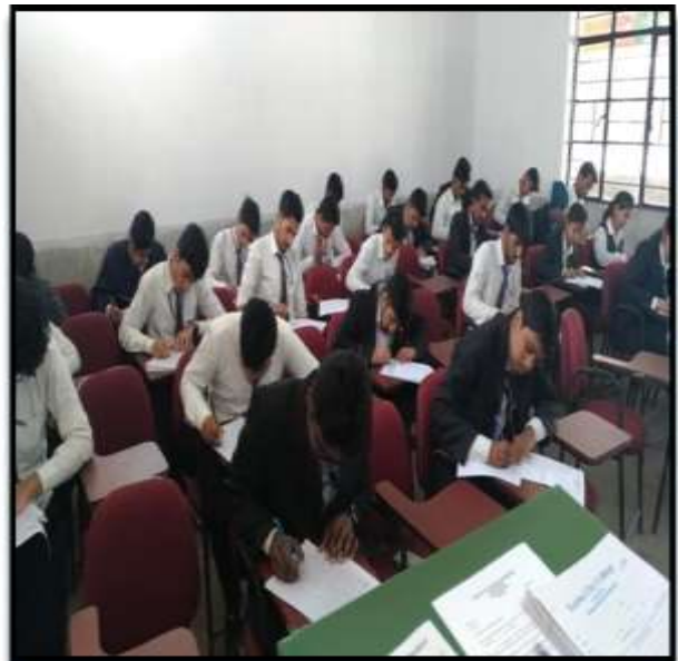
Sem II & Sem IV Internal Exam