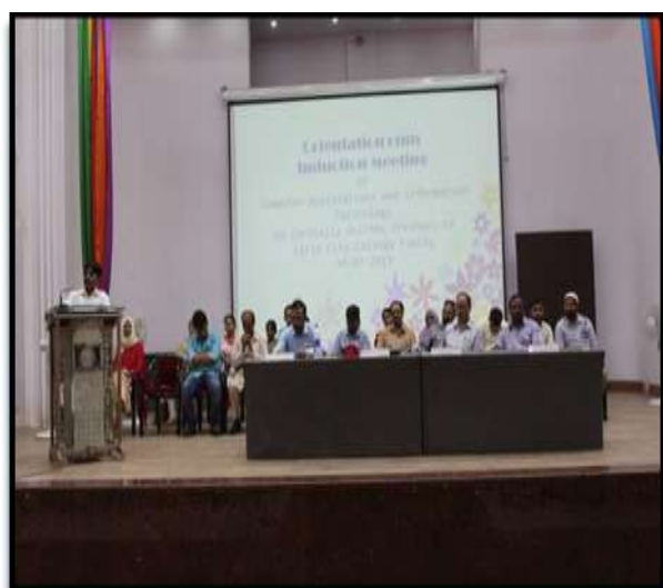
Principal Addressing The Parents