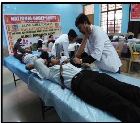
Students Donating Blood