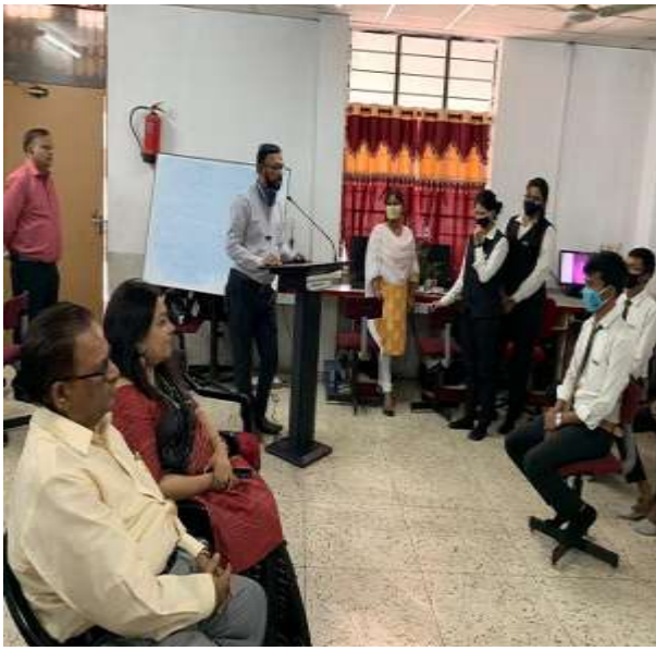
Prof-In-Charge Addressing The Contestant