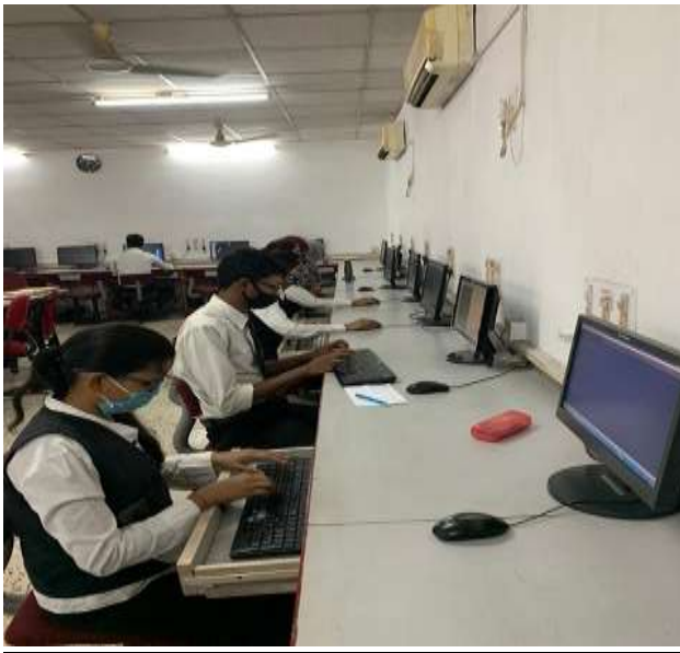
Participants Of Web Hunt Competition