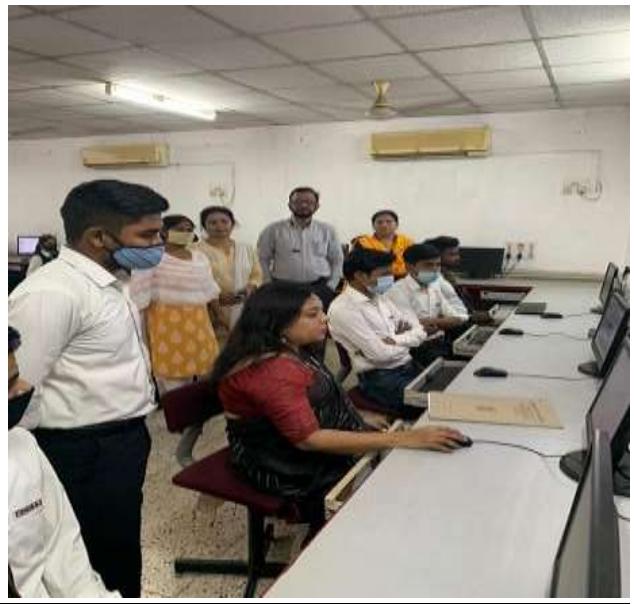
Judge Reviewing The Web Pages