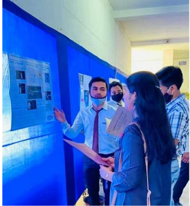
Poster Demonstration By Participant