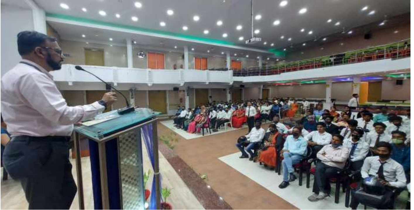
Prof-In-Charge Addressing The Parents