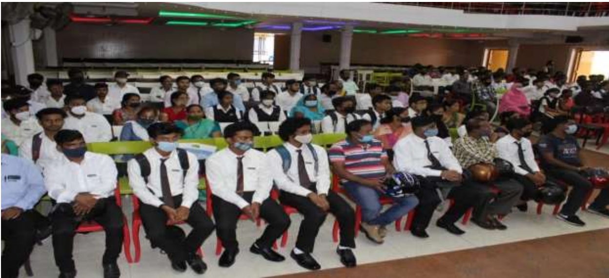
Parent & Students In The Meeting