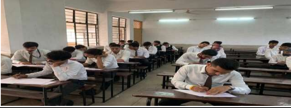
Sem V Internal Exam