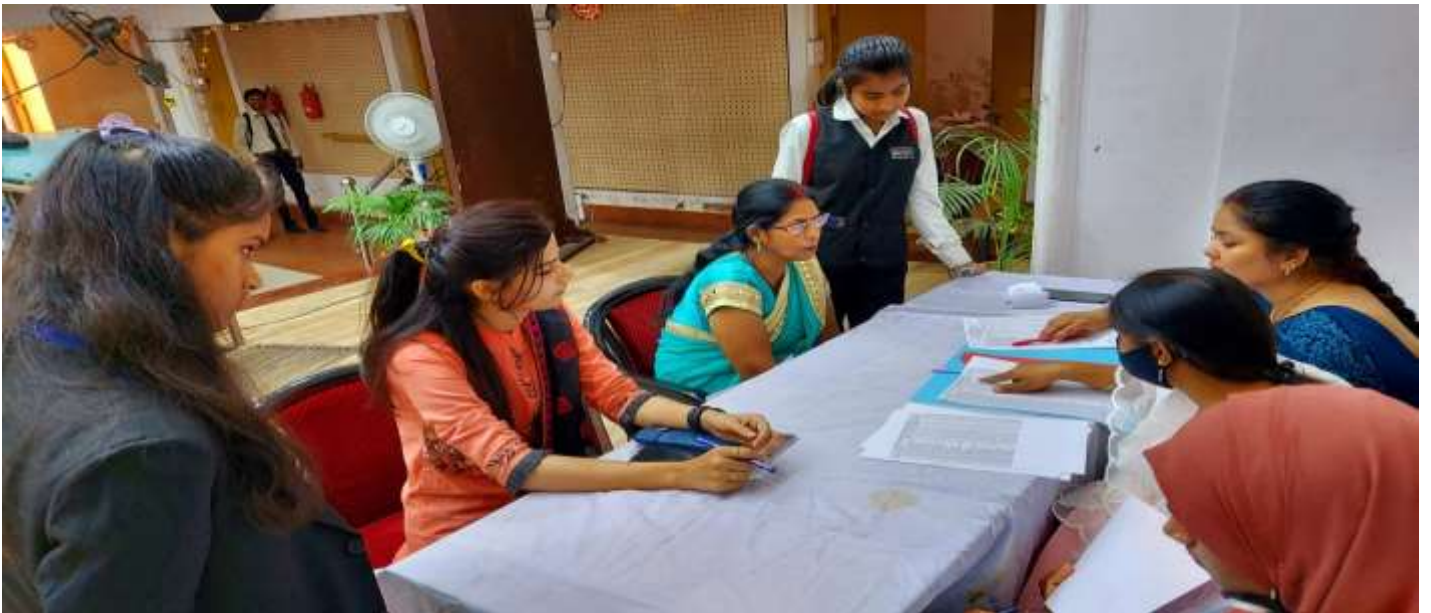
Teachers Interacting With Parents