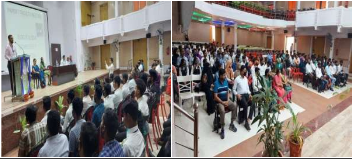
Parents Teachers Meeting