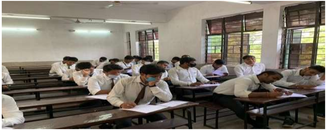
Sem I Internal Exam