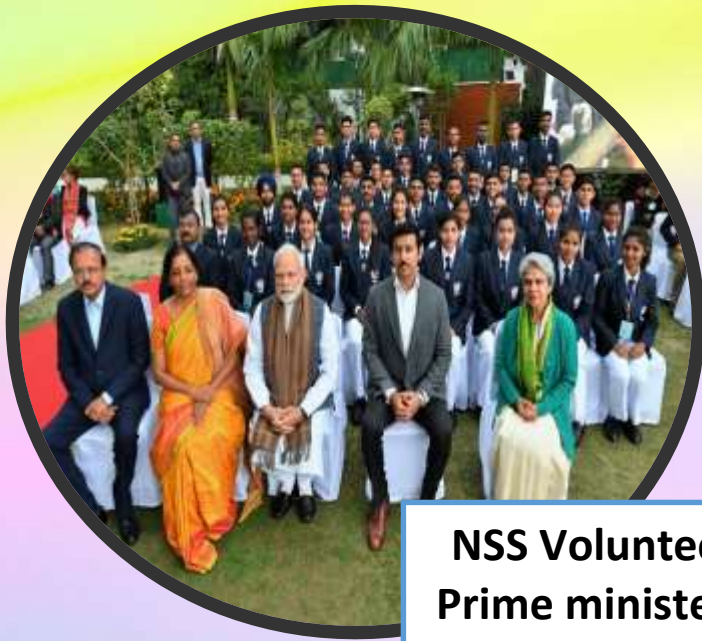
NSS Volunteers With Prime minister of India