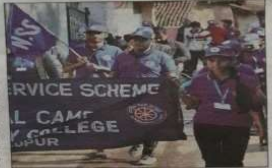
SPIC & SPAN: Students of Karim City College at Kapsali village in Seraikela-Kharsawan district.

The team of 20 volunteers also interacted with the villagers on the importance of