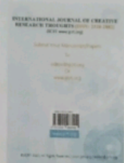
(ijcrt front page final.pdf)