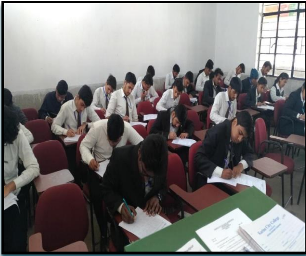
Sem I Internal Exam