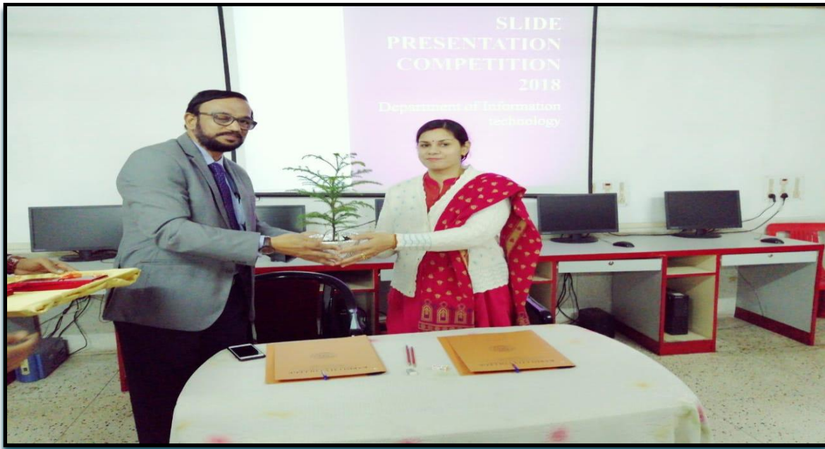
Prof-in-Charge of Department IT Welcoming The Judge