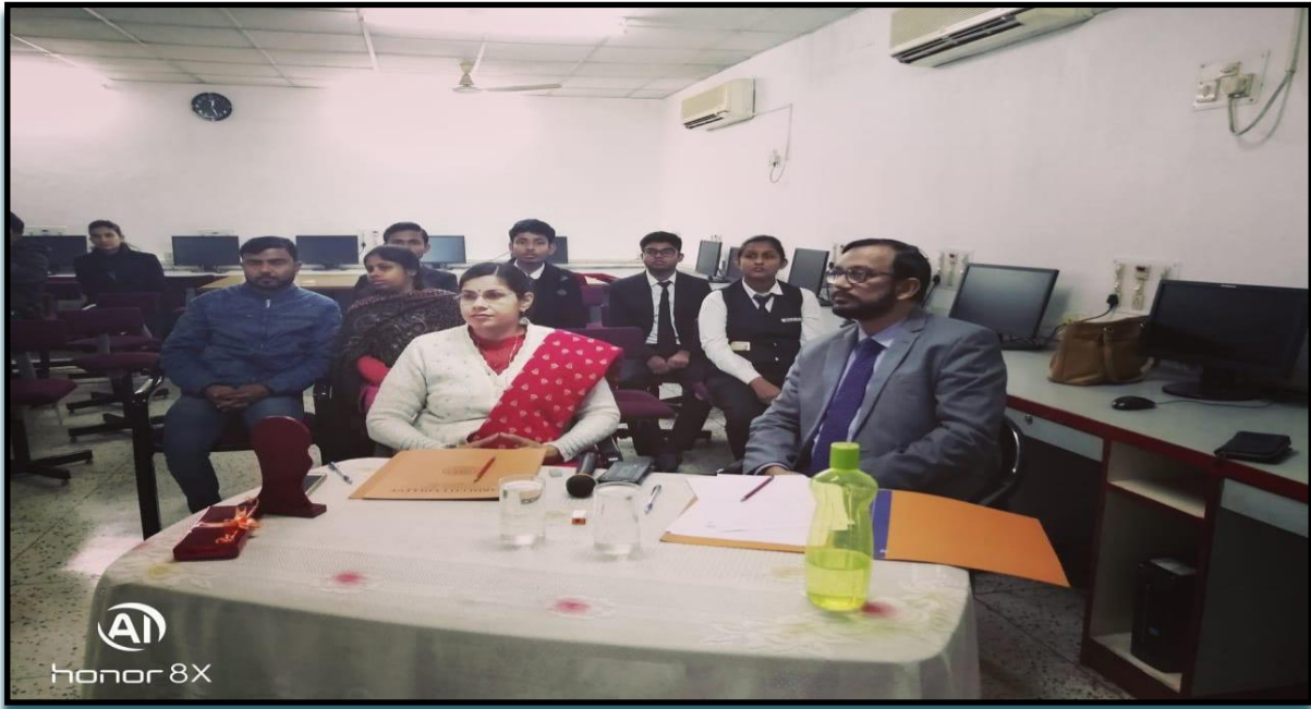
Judges Observing The Presentations