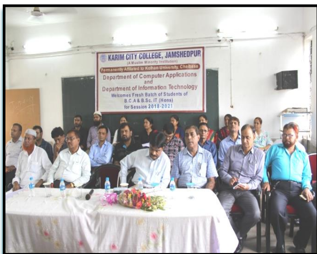
Principal & Faculties Present In The Induction Meeting