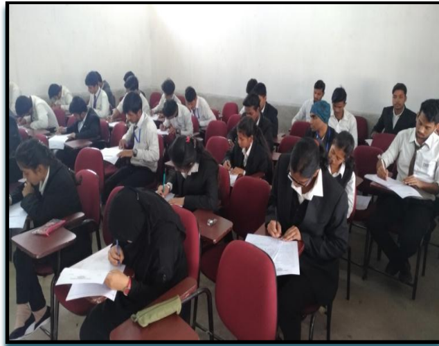
Sem III Internal Exam