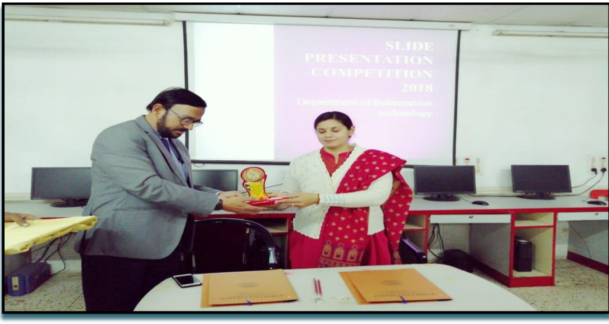
Token Of Love Presented To The Judge