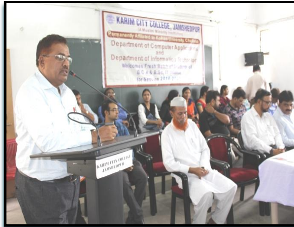
Incharge Admissions Addressing The Students