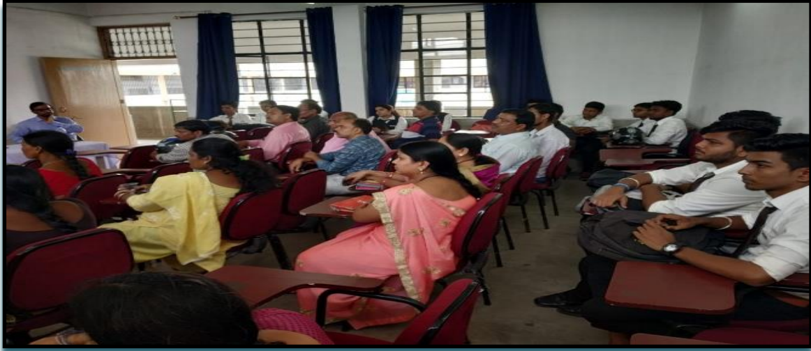
Parents & Students of IT-Part1