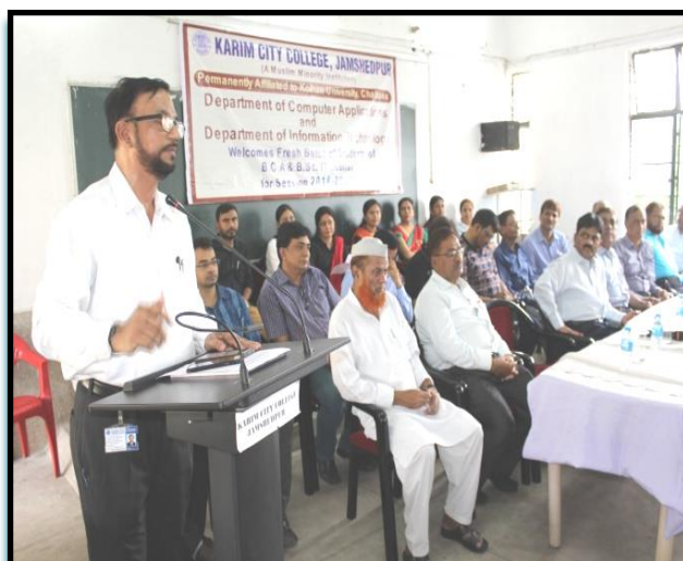
_ Prof-in-charge welcoming the students