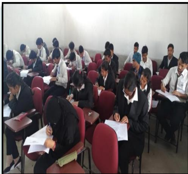
Sem I & Sem V Internal Exam