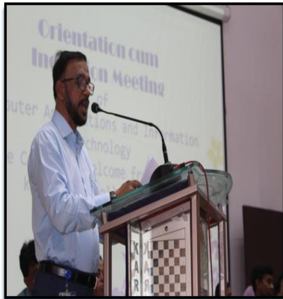
Principal Addressing the Students Prof-In-Charge Giving Welcome Speech