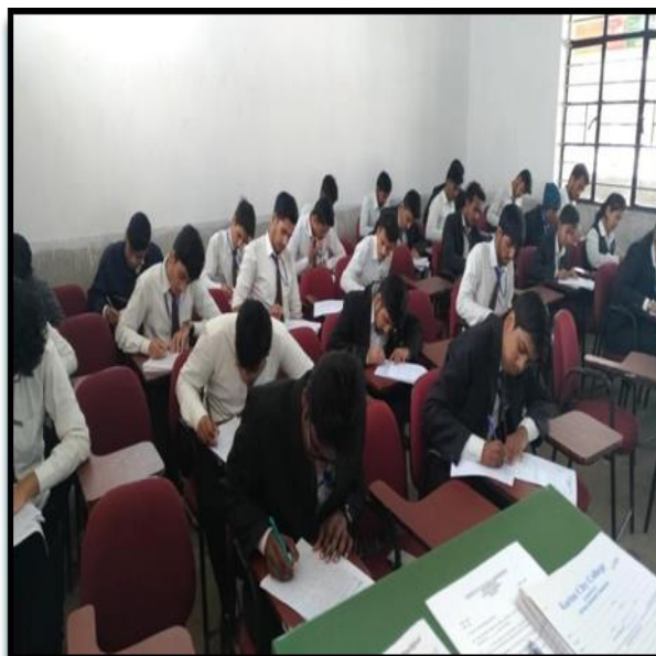
Sem II & Sem IV Internal Exam