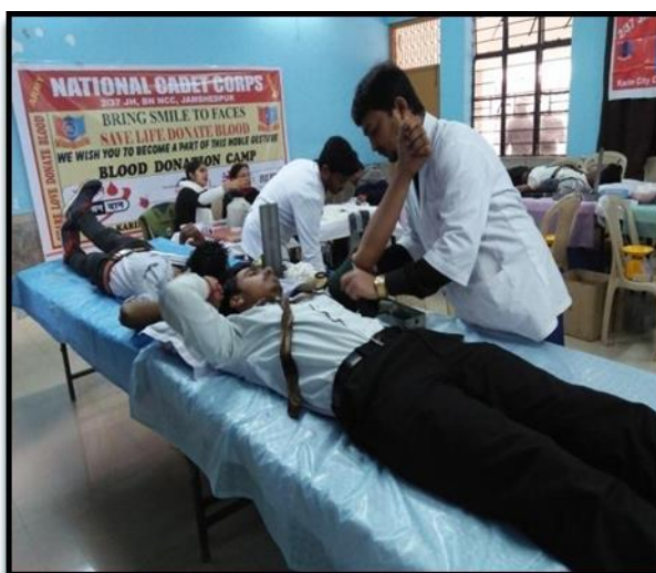
Students Donating Blood