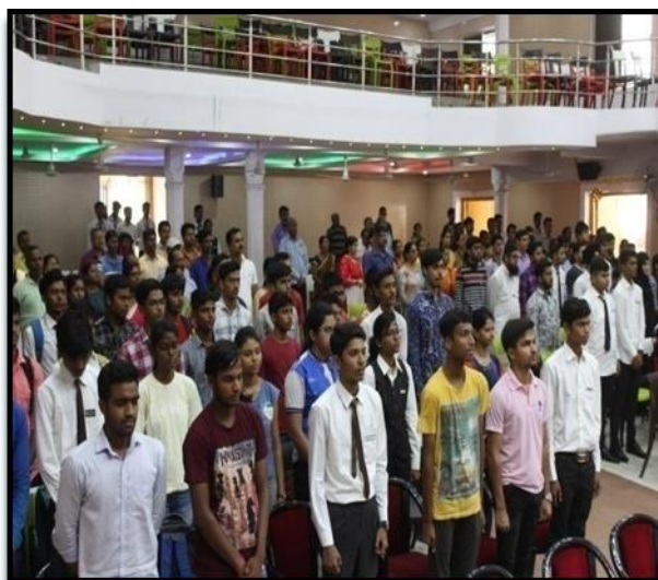
Parent & Students