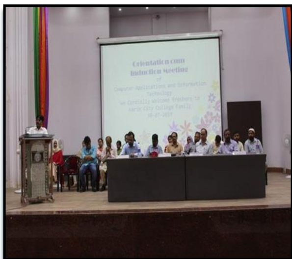
Principal Addressing The Parents