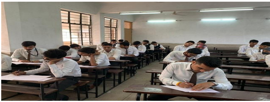
Sem V Internal Exam