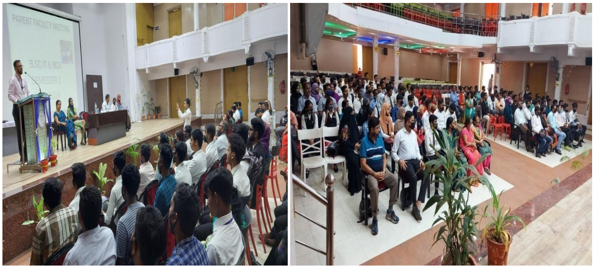
Parents Teachers Meeting