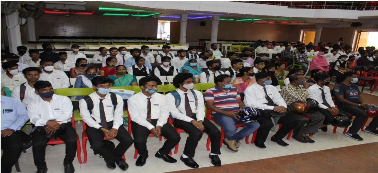
Parent & Students in the Meeting