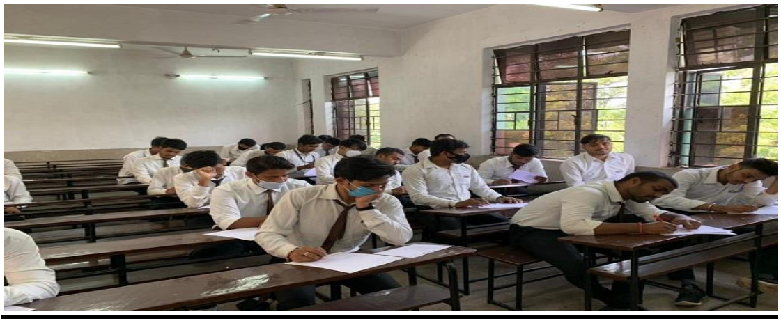
Sem I Internal Exam