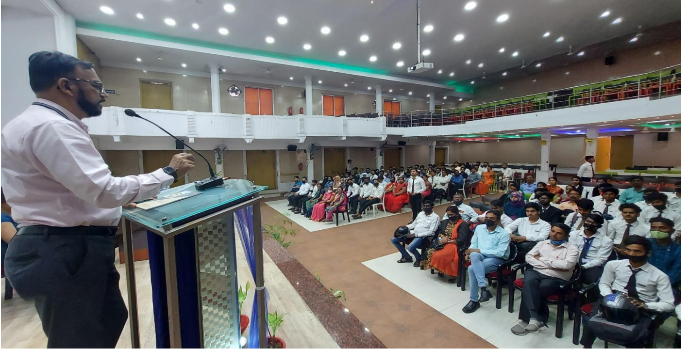
Prof-In-Charge Addressing The Parents