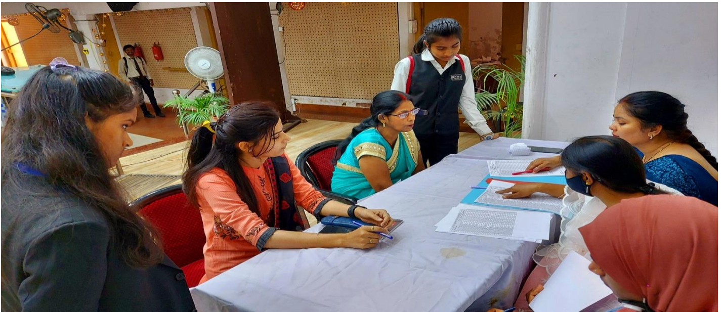
Teachers Interacting With Parents