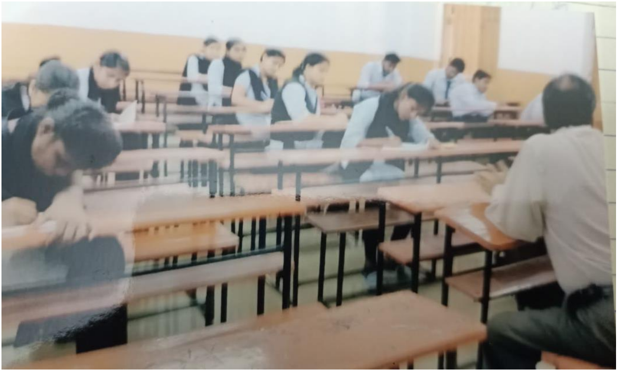
9. Internal Seminar on 16 th February 2020 –