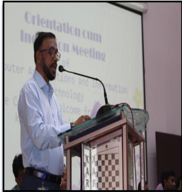
Principal Addressing the Students Prof-In-Charge Giving Welcome Speech